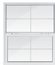
4 x 4 GRID