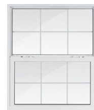
6 x 6 GRID